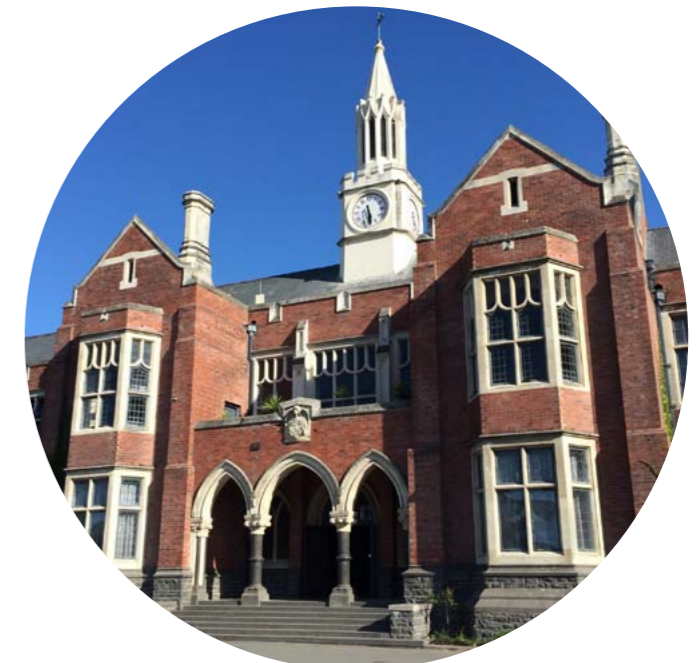
CBHS Heritage Main Block

The guiding values provided by the school in the Strategic Plan are of MEANINGFUL RELATIONSHIPS, INTEGRITY, HIGH EXPECTATIONS AND RESPECT